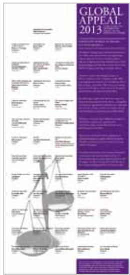
A PDF of Global Appeal 2013 can be downloaded from The Nippon Foundation website.

For the NFI chairman, addressing the ceremony was a personal landmark in the fight for dignity and recognition. He later said: “I do not have the words to express how privileged and proud I felt to represent my country at the Law Society as a grassroots activist and as a person affected by leprosy.” ■