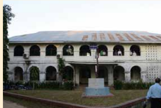
With a resident of Mawlamyine Christian Leprosy Hospital (top); hospital exterior (above)