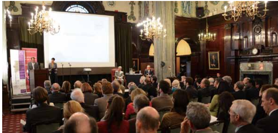
Around 200 people gathered at the Law Society in London for the launch of Global Appeal 2013.

The 8th Global Appeal takes aim at outdated legislation on leprosy.