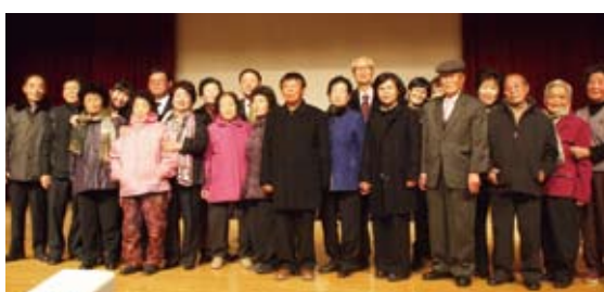
People affected by Hansen's disease at the World Forum

Organized by the Hanvit Welfare Organization, a nonprofit corporation dedicated to promoting the rehabilitation of persons affected by leprosy