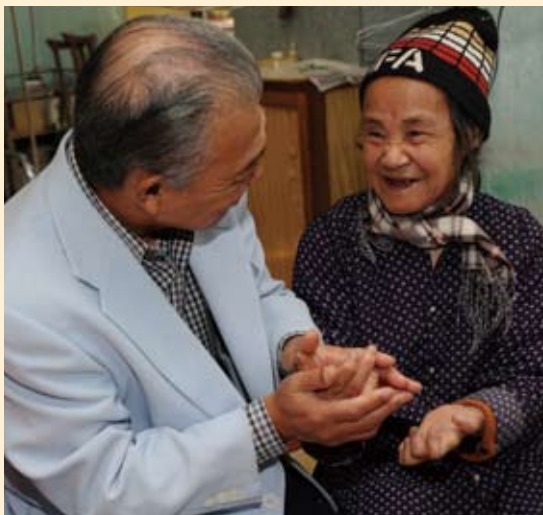
Saying hello to a resident of Ba Sao treatment center