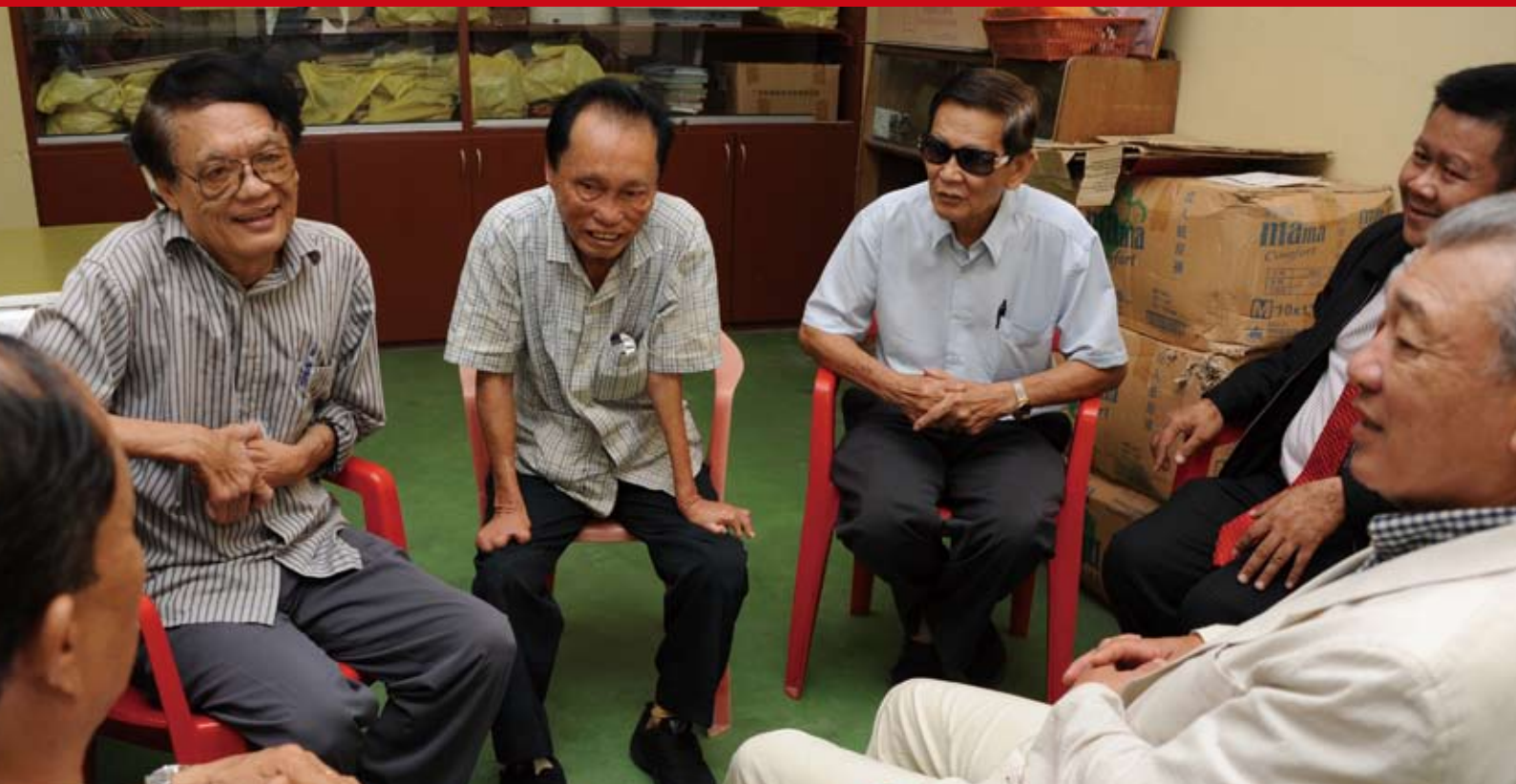
Yohei Sasakawa listens to community leaders at Sungai Buloh leprosy treatment center in Malaysia, when he visited in November.