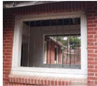
The barred windows of Sorokdo's former prison

Older buildings recall a different era, when the attitude toward the colony's inmates was in marked contrast to today. There is the former prison, where those who disobeyed the rules were sent as punishment. Using his own blood, a detainee wrote on the wall lamenting his fate.