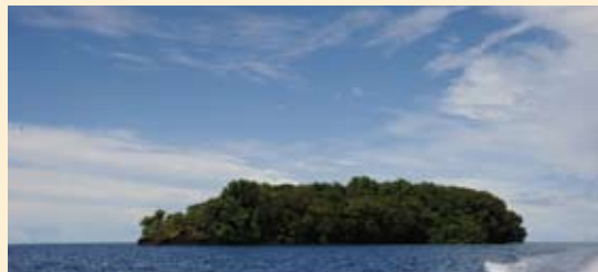
Raibyo-shima, where people with leprosy were sent during the era of Japanese rule

On November 11 I traveled to Palau in Micronesia. My destination was Koror Island, seat of Palau's capital until 2006.