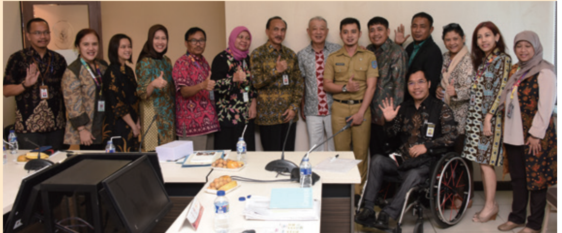
With participants in the meeting at the Coordinating Ministry for Human Development and Culture in Jakarta on Oct. 2.

On his latest visit to Indonesia, WHO Goodwill Ambassador for Leprosy Elimination Yohei Sasakawa is encouraged to see the government take a multi-sectoral approach to tackling the medical and social dimensions of the disease.