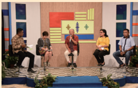
Appearing on TVRI (Televisi Republik Indonesia) to talk about leprosy.

Among those taking part were a number of persons affected by leprosy. They included a pastor diagnosed with leprosy in 2017 who had been