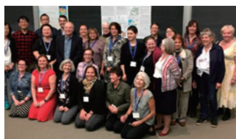
Conference emphasized "commonalities between scholars" working on leprosy in fields not normally brought together

We look forward to the second meeting of Leprosy and the ‘Leper’ Reconsidered because we hope to continue to foster a strong dialogue between the humanities and the sciences so that we can develop well-rounded and accessible studies in order to continue to demystify leprosy and the people who are impacted by it. ■