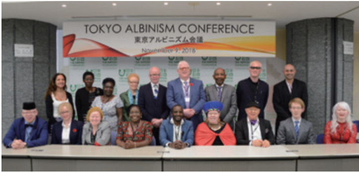
A first for Japan: an international conference on albinism

Tokyo Albinism Conference touches on some familiar themes for leprosy.