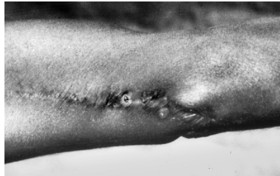
FIGURE 22-1 Sinus along the line of incision for cubital tunnel decompression.

of scar which refuses to heal (Fig. 22-1). The sinus may need excision and removal of necrotic tissue, or a course of rifampicin and isoniazid can be tried which may dry the sinuses in about six months. 10