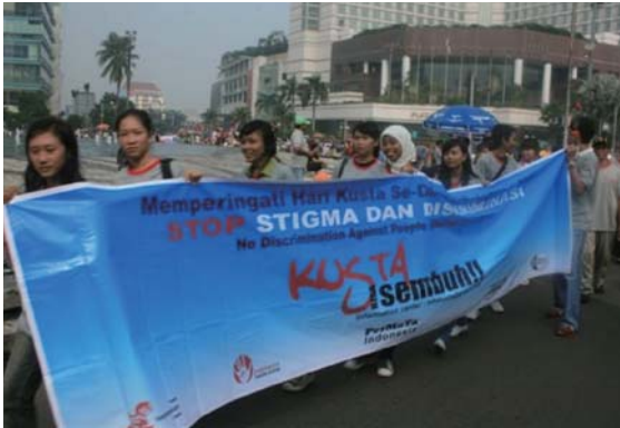
PerMaTa rallies in Jakarta on World Leprosy Day.

Opportunity to raise awareness and promote human rights