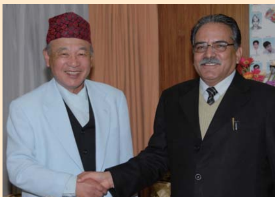
With Prime Minister Prachanda in Kathmandu