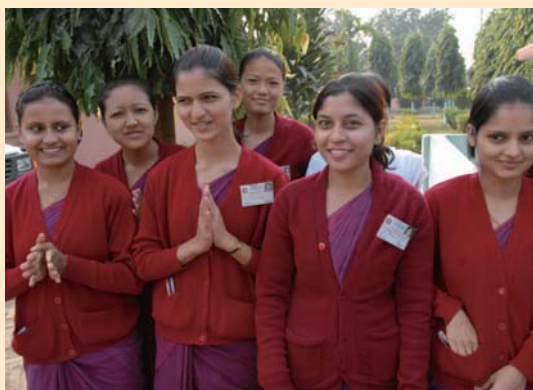
Volunteer health workers at Mangalbari PHC