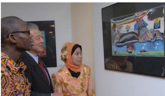
Time out to admire paintings from the Bindu Art School