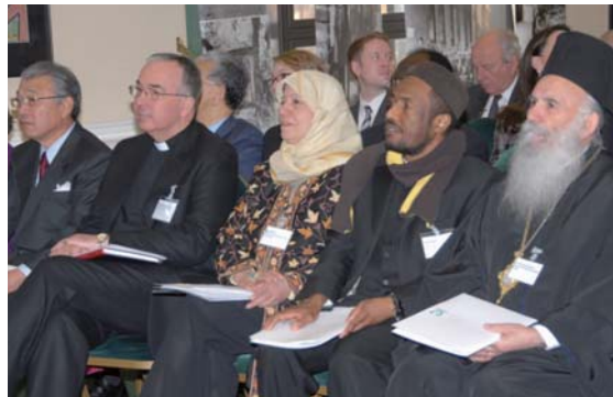
Global Appeal 2009 was truly an inter-faith gathering.

Sasakawa said that removing discrimination from society "requires the cooperation of society's most influential members. Therefore, I ask the religious leaders who have signed this year's Global Appeal to convey its message to their believers and followers."