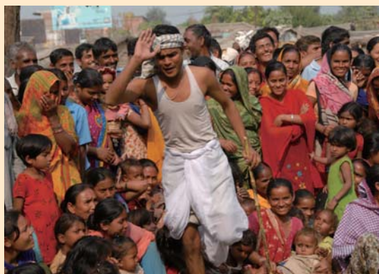
Street theater in Dhanusha District

Following that, I was briefed by the Morang District public health officer, and attended street theatre designed to raise leprosy awareness. The specially arranged performance took place in the forecourt of a hospital that included a regional leprosy clinic — my next stop.