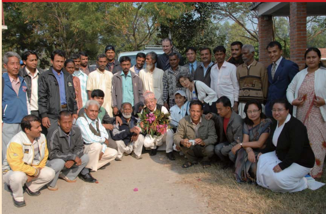
A courtesy call on Lalgadh Leprosy Services Center

of them, along with some 50 female volunteer health workers serving the local community.