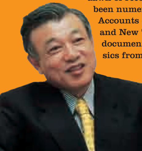
Yohei Sasakawa WHO Special Ambassador President, The Nippon Foundation