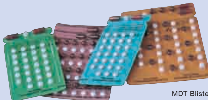
MDT Blister Packs