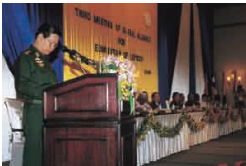
H.E. General Khin Nyunt announces leprosy elimination.