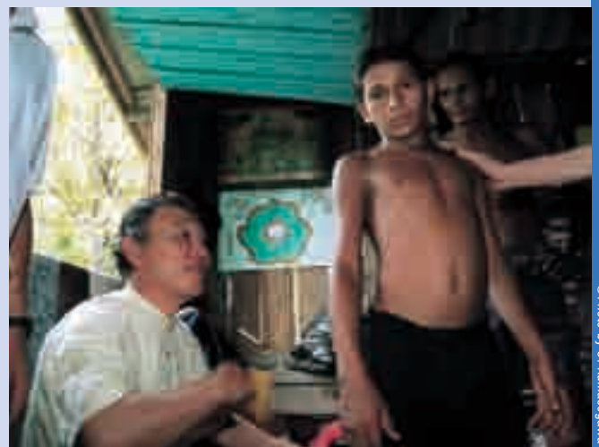
With the family of a patient in Amazon

I also had an opportunity to visit the Amazon State capital of Manaus and the nearby city of Manacapuru, both of which have a high incidence of leprosy. The Health Bureau of Manaus kindly arranged for us to visit clinics and nearby villages where leprosy patients live. We traveled with local paramedics to small villages on the banks of the Amazon River, where we visited the homes of people undergoing treatment. I was very impressed with these paramedics' dedication to detection, medical care, record keeping and skilled operational management. I was deeply touched by the warm care given by family members. Contrary to what has often been the case in the past, in that region the patients are not abandoned but protected and cared for by loved ones. This degree of warmth would not have been possible without a successful campaign of information dissemination.