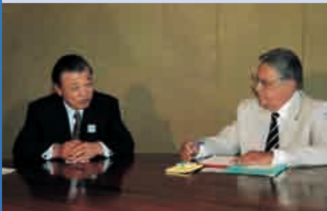
Yohei Sasakawa (left) with President Cardoso of Brazil

My first leprosy-related activity of the year 2002 took place in Brazil when I participated in the Second GAEL Meeting, held in Brasilia from January 29 to 31. Taking advantage of this opportunity, I met with then President Fernando Henrique Cardoso on January 30 and asked his excellency to give leprosy elimination a high priority among the country's many public-health issues. President Cardoso expressed his willingness and a strong commitment to promote leprosy elimination as an important part of his government's agenda. He evaluated the concept of GAEL highly, placing