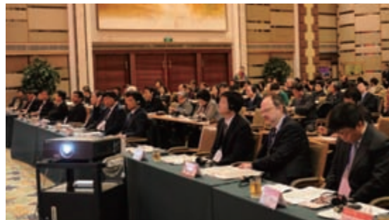
Scenes from the ceremony: the Goodwill Ambassador delivers an address (top) as the audience (above) listens.