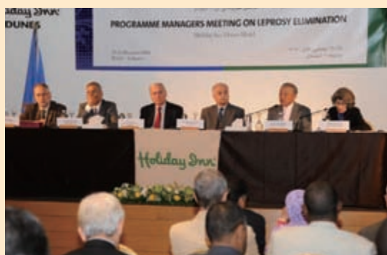
Attending the program managers' meeting in Beirut.

Abu Zaabal leprosy sanatorium is in the north of Cairo. When it was founded in 1932, it was some miles from the city; since then, the city has come to its door. At the time of my visit, there were around 700 patients, 35% of them women.