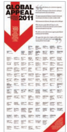
Global Appeal 2011

The Global Appeal launch ceremony was followed by a lively press conference, with the Chinese media asking many questions about leprosy in China. Some 50 articles, mostly in Chinese, were generated by the event. ■