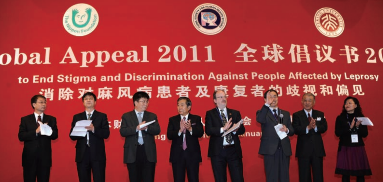
Signatories and their proxies on stage for the reading of Global Appeal 2011 at a ceremony in Beijing on 25 January 2011.