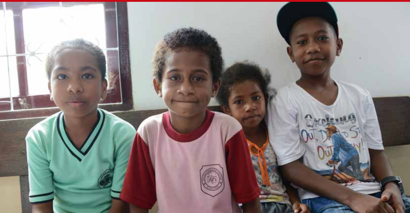
Ensuring that children have a healthy future is a key task (Photograph taken at Jayapura Hospital, Papua Province, Indonesia, January 2014)