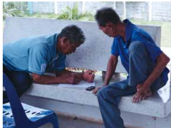
Atmosphere of trust: interviewer at work

After Thailand achieved elimination at the national level, the leprosy program was strengthened. We conducted three Leprosy Elimination Campaigns (LECs) between 1996 and 2002 to accelerate case-finding in the community, which resulted in the detection of new cases. From 1998 to 1999, we carried out Leprosy Elimination Monitoring (LEM) based on WHO guidelines in 32 provinces and implemented a