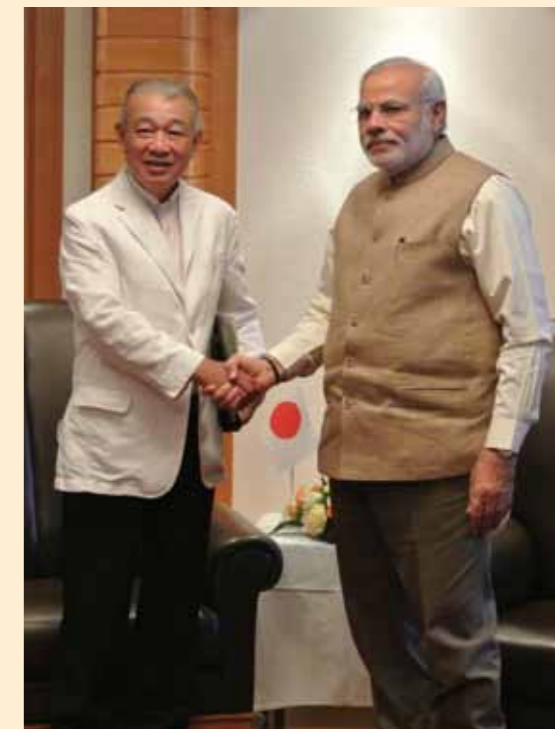
With Prime Minister Modi in Tokyo in September

The prime minister was curious to know how I became involved in leprosy work. I told him I was following the lead of my father, one of whose early acts against the disease was to help