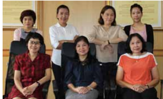
Thailand eliminated leprosy as a public health problem in 1994. We asked staff of the Raj Pracha Samasai Institute of the Ministry of Public Health's Department of Disease Control to explain what the country is doing to sustain leprosy services 20 years on.

How to deal with leprosy and its consequences in a low-endemic context.