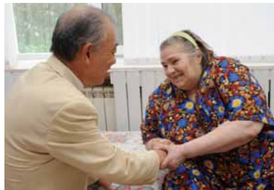
The value of touch: the Goodwill Ambassador in Russia

Leprosy showed me that to inhabit an untouchable body (the most radical form of social exclusion) is to be made by society less human, or even inhuman — without the same civil, political, social and human rights as everyone else. It taught me that touch is central to mutual recognition, which is the first step toward social