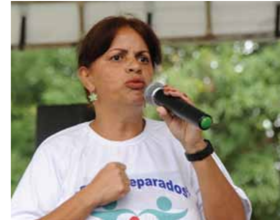
Social struggle involves many hardships and sacrifices.